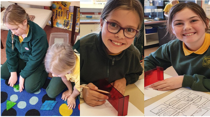
Students focusing on spatial awareness and reasoning

Program Offered - "No Scaredy Cats" – Reducing anxiety and building resilience in children.