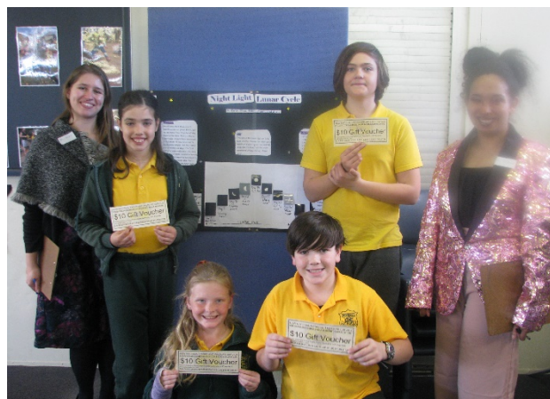
Yr 5/6 Winning Team, Tully absent